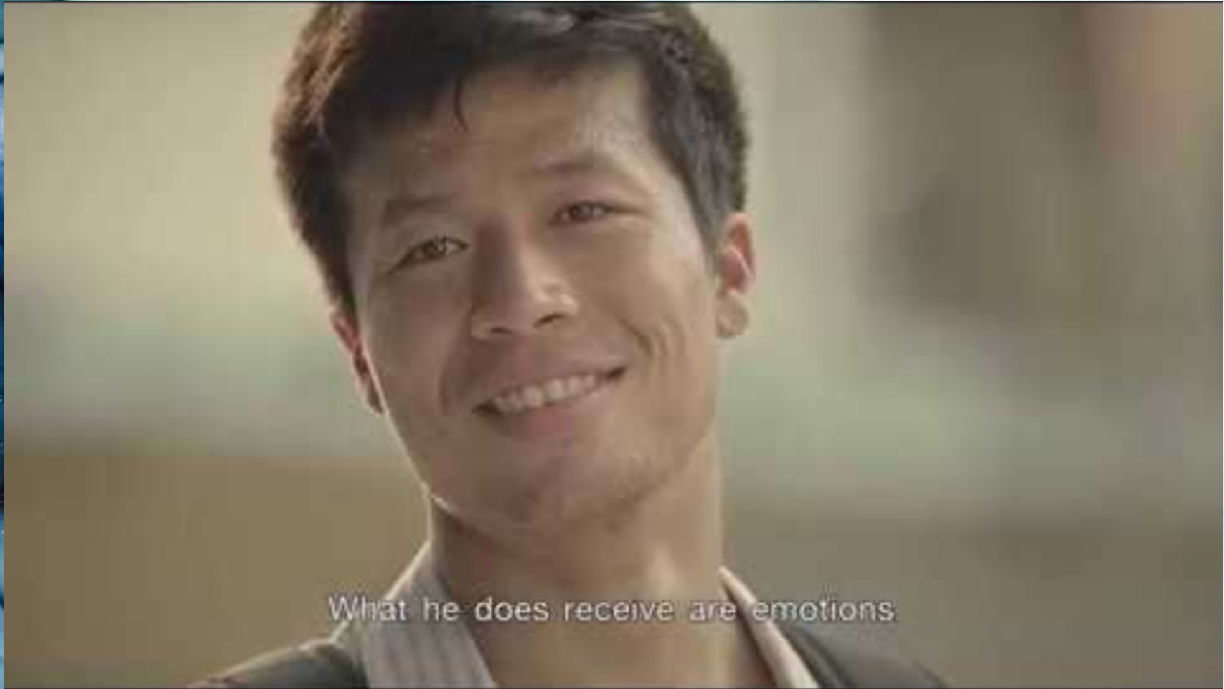
What he does receive are emotions.